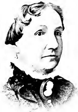
AUGUSTA C. EVANS WILSON.

sent with a letter to her New York publisher, by a blockade-runner, which carried it to Havana, Cuba, whence it was mailed to New York. It was printed on coarse brown paper, copyrighted by the